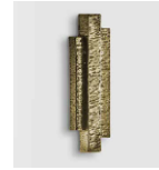
Antique brass with deco detail