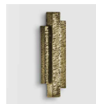
Antique brass with deco