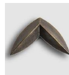
Bronze with leaf