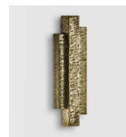
Antique brass with deco