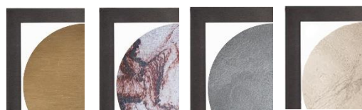
Bronze with hand-gilded gold discs Bronze with hand-gilded blush marble discs Bronze with hand-gilded pewter discs Bronze with hand-gilded champagne discs