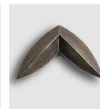
Bronze with leaf